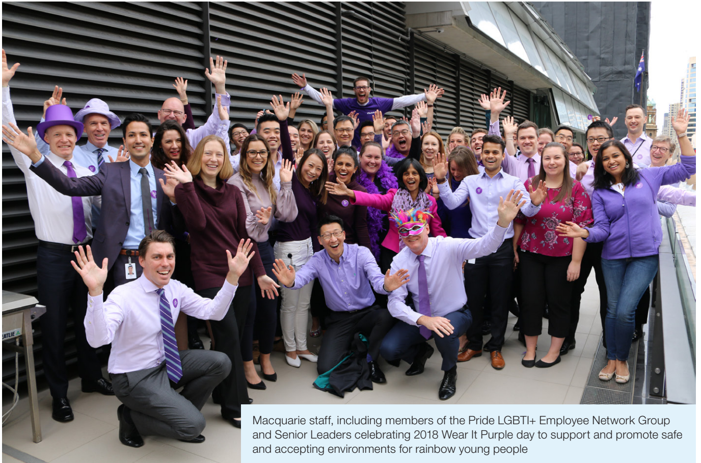
Macquarie staff, including members of the Pride LGBT+ Employee Network Group and Senior Leaders celebrating 2018 Wear It Purple day to support and promote safe and accepting environments for rainbow young people